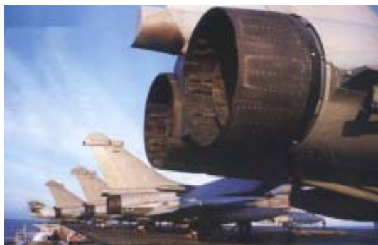
Figure 1. C/SiC secondary flaps of the M88, engine of the French fighting aircraft Rafale.